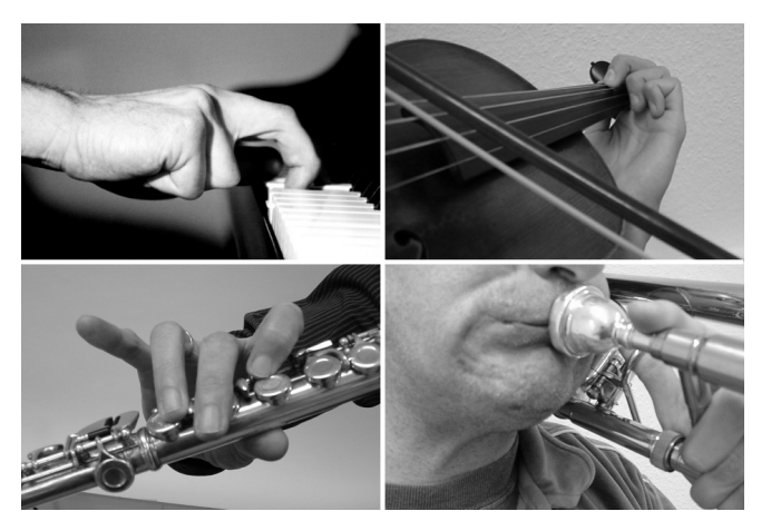
Fig 2. Symptoms of dysfunctional plasticity: typical patterns of dystonic postures in a pianist, a violinist, a flutist and a trombone player. Most frequently, involuntary curling of fingers and compensatory extension of adjacent fingers is observed. In wind instrumentalist, dystonia involves sensorimotor control of the embouchure. Typically in dystonia, no pain or sensory symptoms are reported. Dystonia may afflict almost all groups of instrumentalists but is more frequently seen in the right hand of guitarists and pianists and in the left hand of violinists. Reprinted with permission from Elsevier.<sup>12</sup>

It is not only motor areas, however, that are subject to anatomical adaptation. By means of magnetoencephalography (MEG), the number of nerve cells involved in the processing of auditory or somato-sensory stimuli can be monitored. Using this technique, professional violinists have been shown to possess enlarged sensory areas corresponding to the index through to the small (second to fifth) fingers of the left hand even though their left thumb representation is no different from that of non-musicians.<sup>9</sup> Again, these effects were most pro-